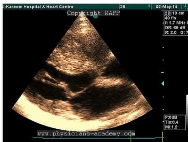
Fig. 1. 2D-Echo. Parasternal Long axis View.